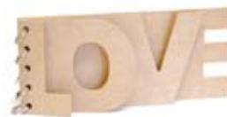
SB132 Love Album