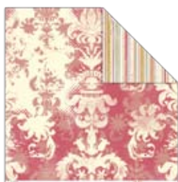
Vagabond Paper Collection