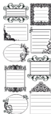
SB547 Flourish Journals