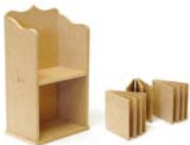
SB2027 Mini Albums x 4 SB2028 Mini Album Bookshelf