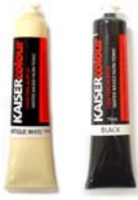
Kaisercolour - Antique White, Black