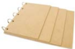
SB146 Occasion Planner