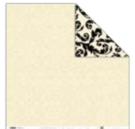
The To Have & To Hold Paper Collection