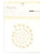
Pearls - Pearl